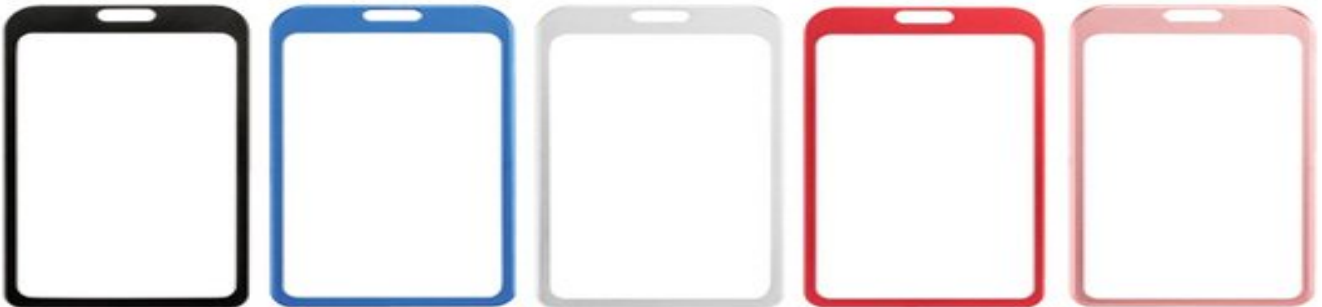
Holder Size - 2 1/4 inch x 3 3/4 inch