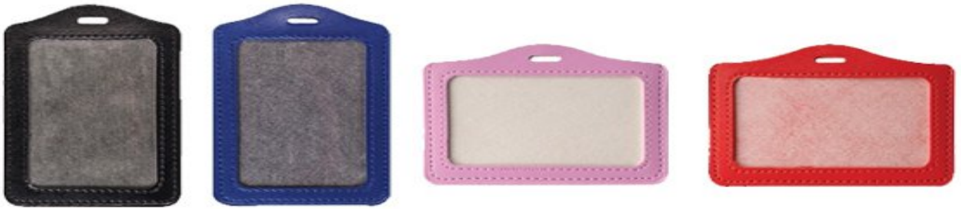
Vertical Size - 2 4/5 inch W x 4 2/5 inch H