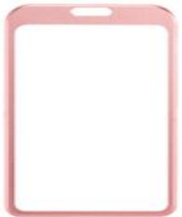
Holder Size - 2 1/4 inch x 3 3/4 inch