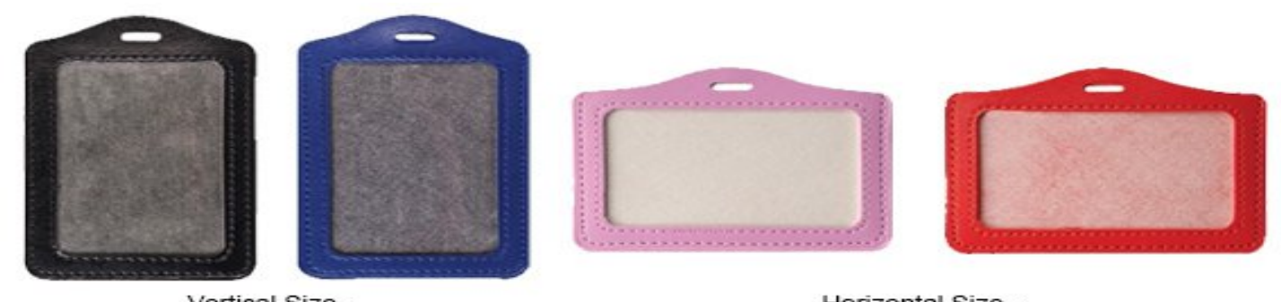
Vertical Size -2 4/5 inch W x 4 2/5 inch H