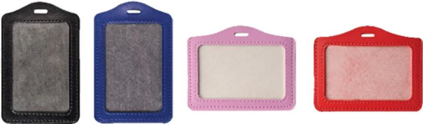
Vertical Size - 2 4/5 inch W x 4 2/5 inch H