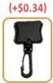
Plastic Swivel Hook