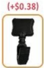
Plastic Bulldog Clip