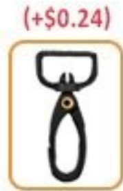
Plastic Oval Hook