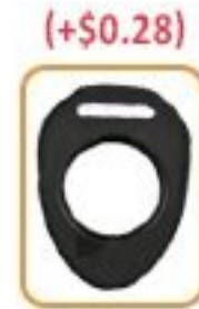
Plastic Canteen Clip