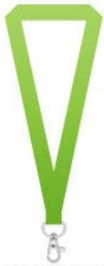
Light Green PMS 360