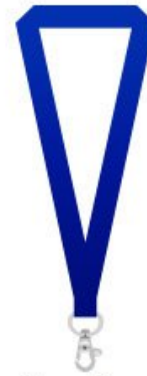
Navy Blue PMS 655