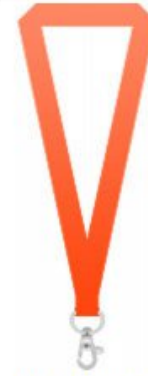
Red Orange PMS 172