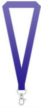
Royal Blue PMS 662