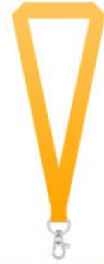
Athletic Gold PMS 130