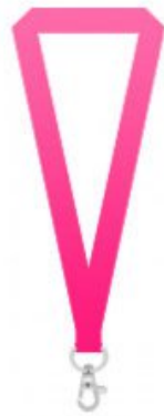
Hot Pink PMS 806