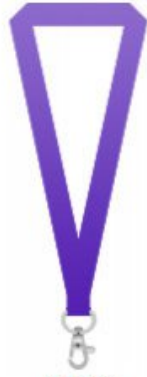
Violet PMS 266