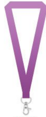
Purple PMS 2607