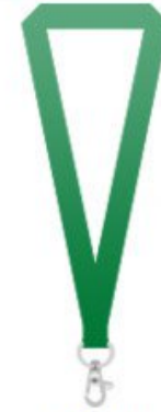
Green PMS 356