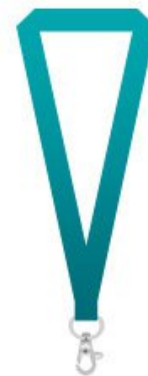
Teal PMS 632