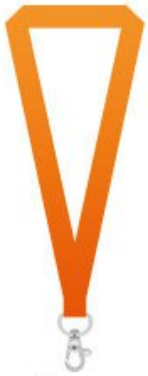
Orange PMS 021